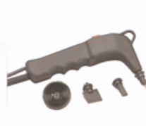
Steam Gun PA