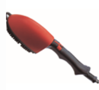
Steam Brush BRA 500